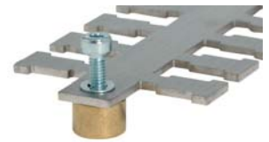
Type DH: Mounted on bushing for flexible fixation on bottom sheet