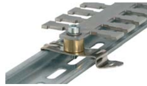
Type SF: Mounted on snap foot for DIN-rail shape H