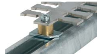
Type SC: Mounted on screw-foot for DIN-rail shape C