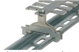
Type SK: Mounted on screw-foot for DIN-rail shape H